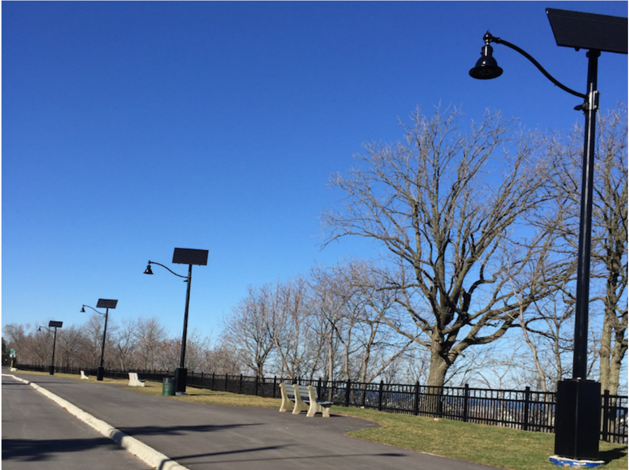
Illumient Smart Off-Grid Lighting along Mountain Brow Blvd, City of Hamilton.