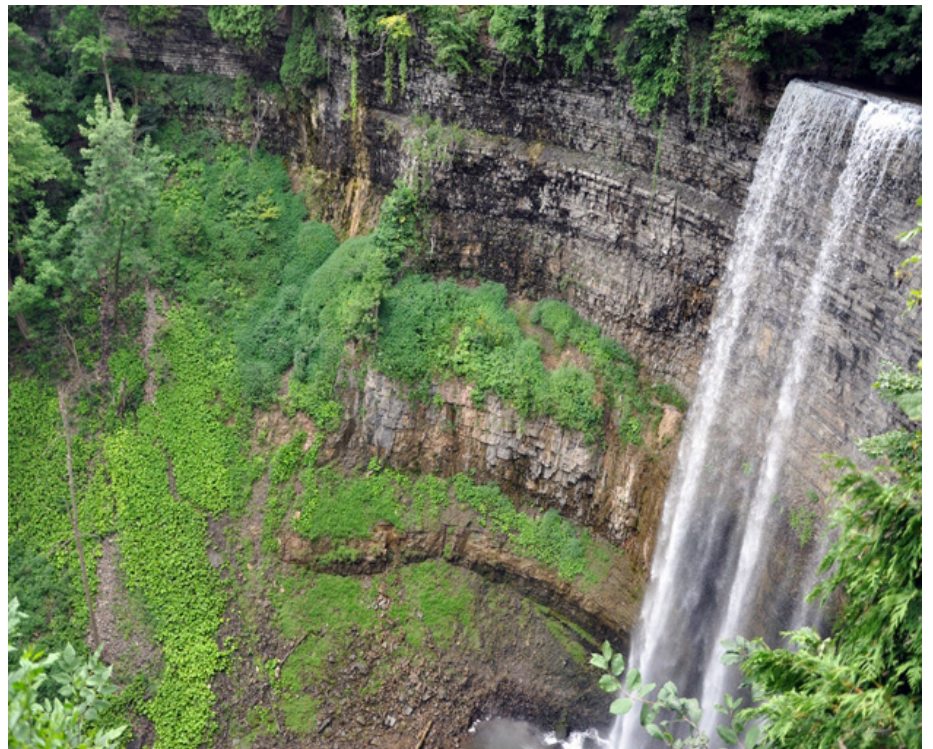
Tews Falls, part of the Niagara Escarpment in the City of Hamilton

The Niagara Escarpment also runs through the City of Hamilton. It is one of the world’s unique natural wonders, part of a gigantic geological formation composed of rock strata with a long slope on one side and a steep scarp of cliff on the other. In the shape of a gigantic horseshoe, the Escarpment can be traced from near Rochester, New York, south of Lake Ontario to Hamilton, then north to Tobermory on the Bruce Peninsula.